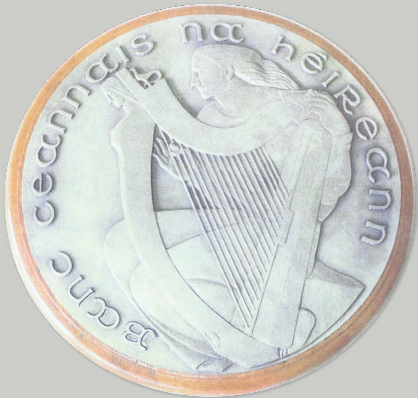
DJEVOJKA S HARFOM • GIRL WITH HARP